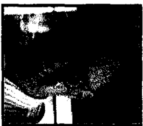
of Worms, with Observations on Their Habits (mould referred to the upper organic layer of soil). It was published in 1881, two months before his death.

Gould had selected this writing of Darwin's because it was not only his last, but it summed up the complete theory of evolution. He showed that very small changes over long periods of time have had great effects on the physical environment and living organisms. It also showed how science is done and, most importantly now science is used.